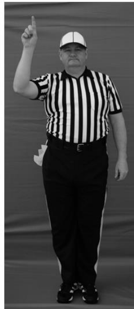
9. First Down Repeated

Stand parallel to ball with arm extended