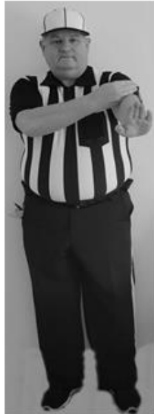
31. Unnecessary Contact

Both arms extended with thumbs pointing up.