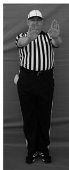
29. Pass Interference Both arms pushing away from shoulders with open hands