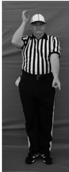
19. Grounding One arm pointing to ground other makes a passing motion