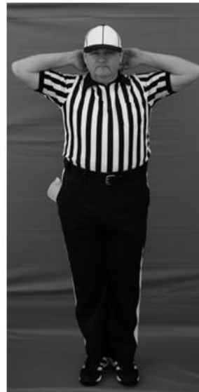
17. Improper Equipment Both hands behind head