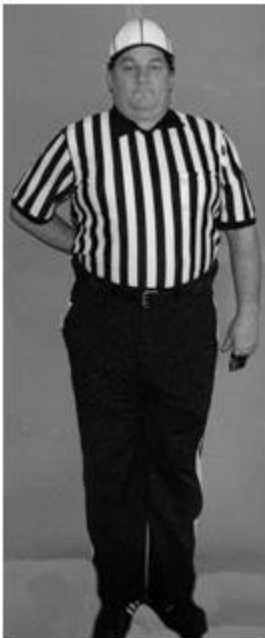
34. Objectionable Conduct