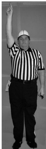
3. Convert 1point

One arm extended above head with 1 finger up