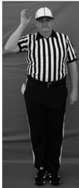
32. Contacting the Passer.

Arm extended with open hand, while making a chop motion at elbow with other