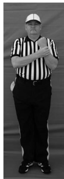
25. Holding Grab wrist at shoulder height