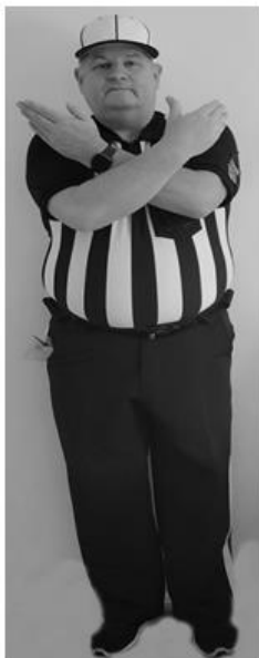
22. Interfering with the Rusher Cross arms in front of chest