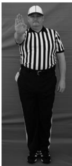
28. Illegal Contact One arm extended with open hand