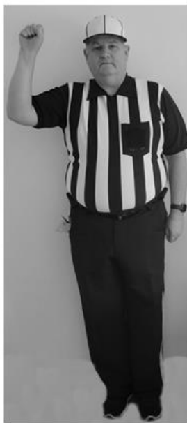
12. Fourth Down