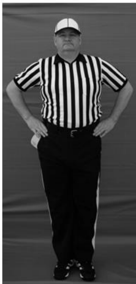
20. Offside Move hands into waist