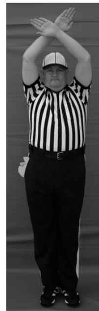
5. Time Out

One arm extended above head with 2 fingers up