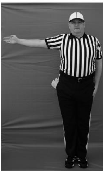
23. Time Count Extend arm parallel to ground and move in a circular motion