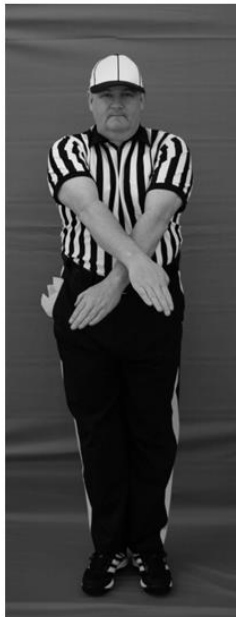
7. Penalty Declined

Throw flag to ground and crossing arms in front