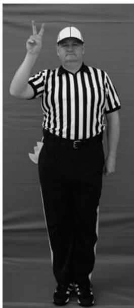
10. Second Down