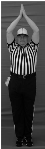
2. Safety Touch