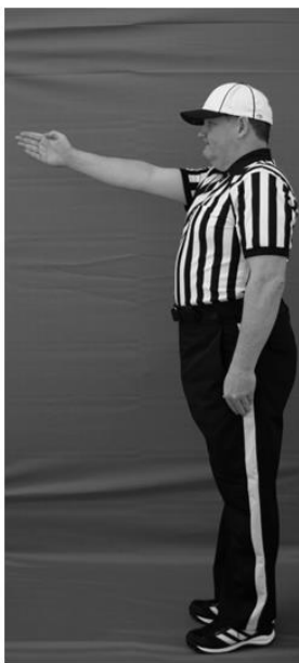
8. First Down Awarded

Stand parallel to ball with arm extended