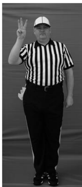
11. Third Down