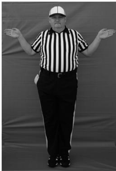
16. Illegal Forward pass Both arms extend sideways