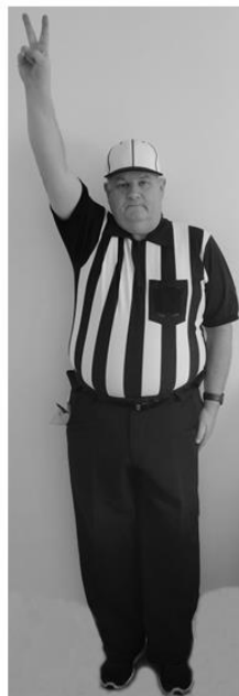
4. Convert 2 points

One arm extended above head with 1 finger up