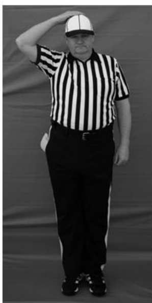
24. Substitution Hand patting top of head