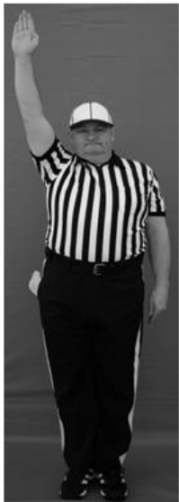
14. Forward Pass completed behind LOS Extend arm above head