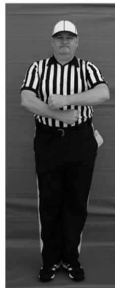
21. Procedure Rotate hands in circular motion