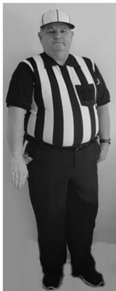
18. Flag Guard Swing arm at waist level