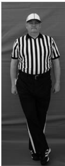
27 Tripping Crossing one foot in front of the other