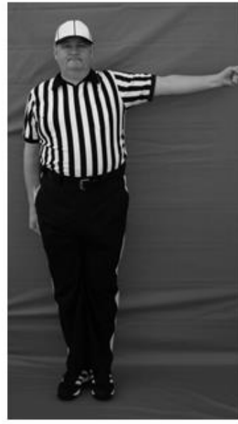
33. Unnecessary Roughness