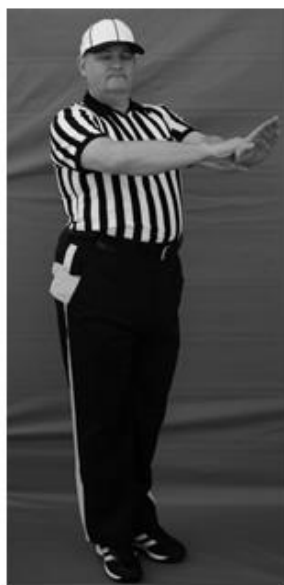
26. illegal Block Grasping wrist and pushing forward from shoulder