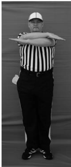
15. Incomplete pass Crossing arms at shoulder height