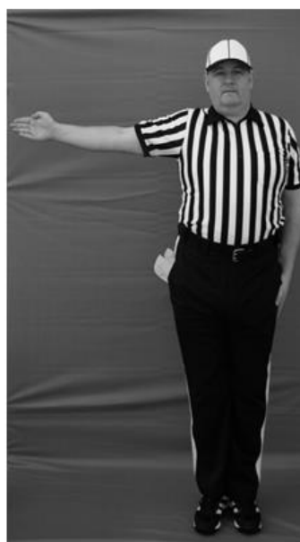
13. Lateral Pass